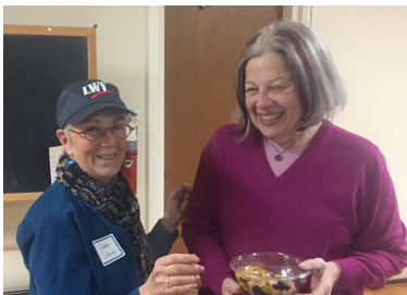
38 Leaguers attended and ate well at the January Potluck.