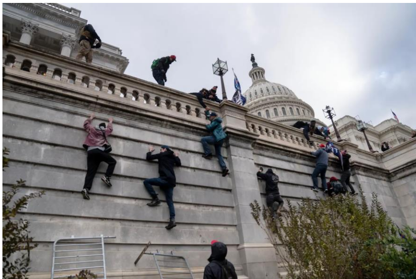
Trump supporters scale the walls of the Capitol's Senate during the insurrection.