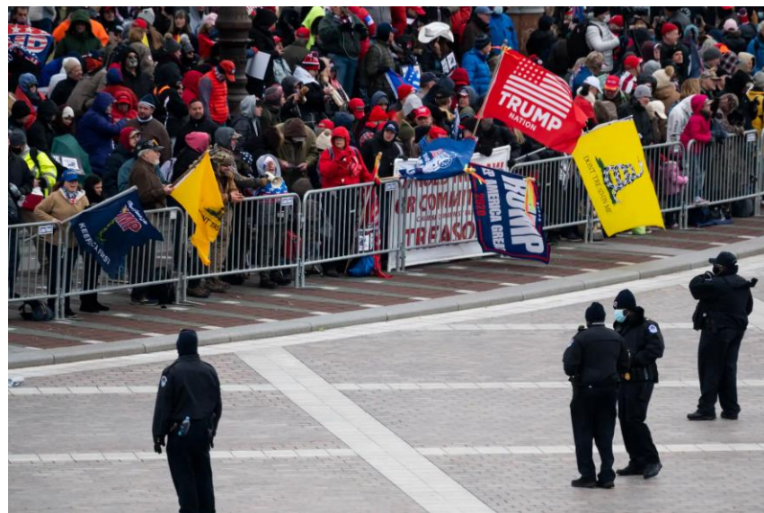
Only a few hundred Capitol Police officers faced the massive crowds.